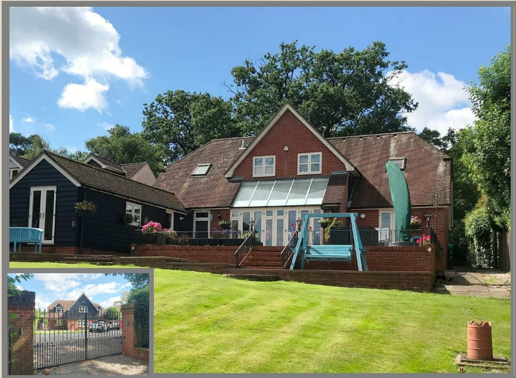
Oak House, The Ridge, Cold Ash, RG18 9HX